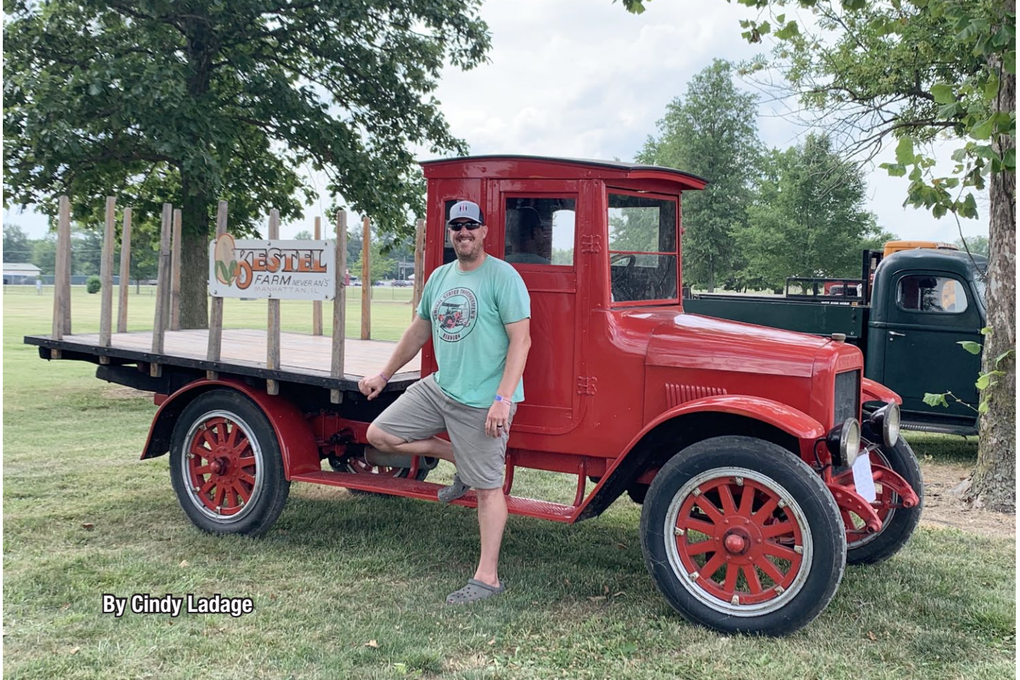
By Cindy Ladage